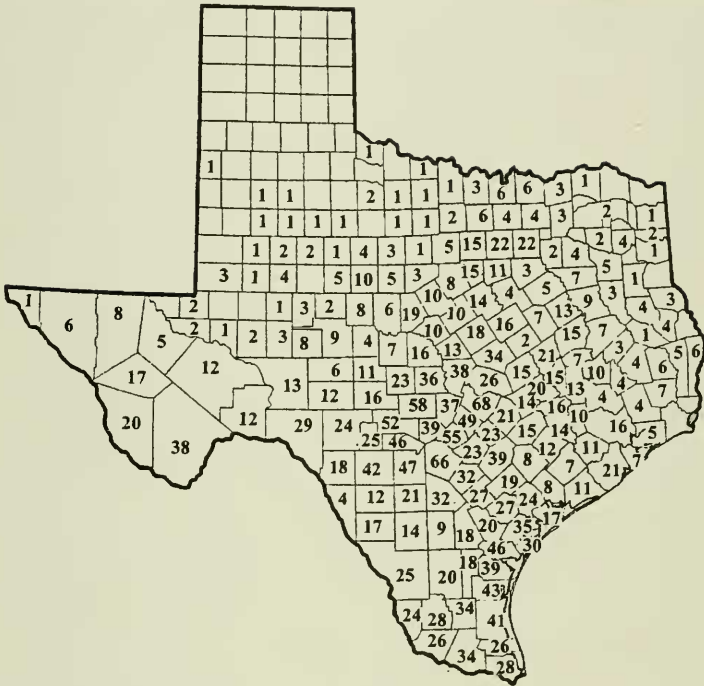
Figure 3. Number of Texas endemics by county. No number means no endemics.

Texas, 68% in Mississippi, 56% in Arkansas, and so on. The North American distribution of Louisiana rare plants is much wider than that of Texas rare plants. This is, of course, because 82% of the Louisiana list are G4-G5/S1-S3 and about 90% of all taxa on this list are at the edge of their range; only about 20% of Texas taxa are edge of range.